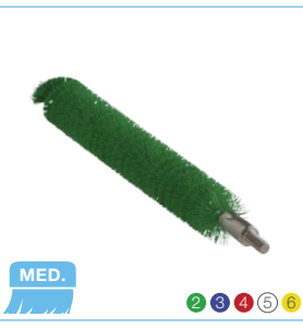
5365x Vikan Ø0.8" Tube Brush for Flex Rod