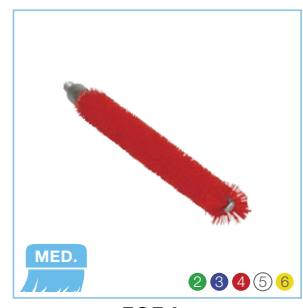
5354x Vikan Ø0.5" Tube Brush for Flex Rod