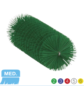
5356x Vikan Ø2.4" Tube Brush for Flex Rod