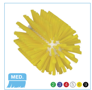
5380-90-x Vikan Ø3.5" Pipe Brush