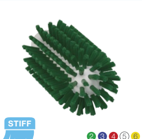
5380-63-x Vikan Ø2.5" Pipe Brush