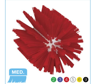
5380-103-x Vikan Ø4.0" Pipe Brush