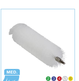
5368x Vikan Ø1.6" Tube Brush for Flex Rod