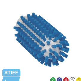
5380-50-x Vikan Ø2.0" Pipe Brush