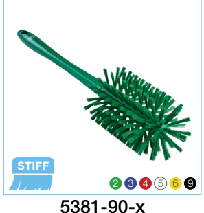
5381-90-X Vikan Ø3.5" One-Piece Pipe Brush