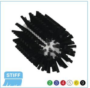
5380-77-x Vikan Ø3.0" Pipe Brush