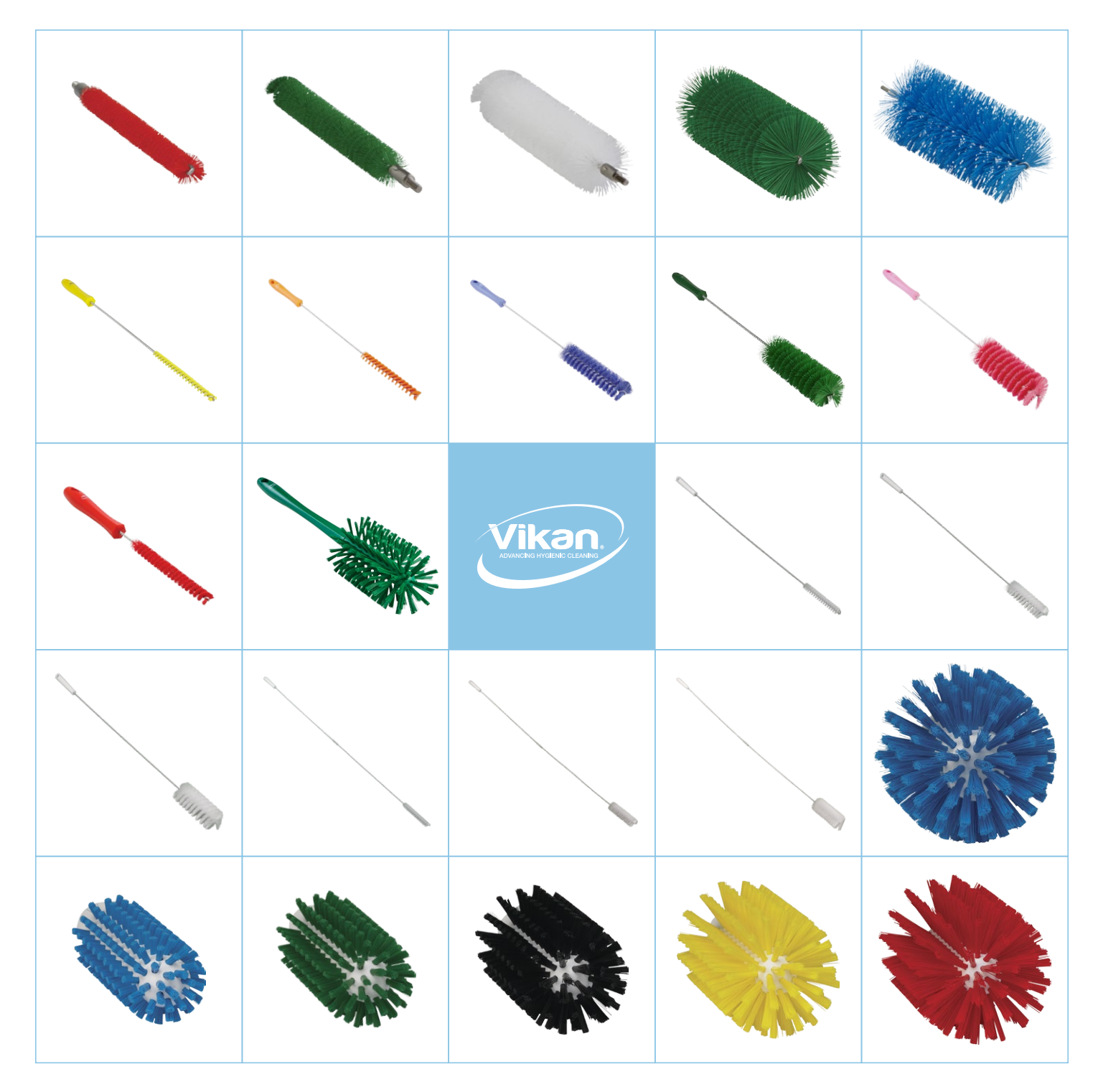
Remco is the exclusive Vikan Partner in the United States and Canada