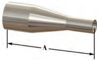
BPE Table DT-4.1.3-1(a)