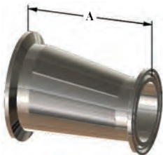
BPE Table DT-4.1.3-3(a)