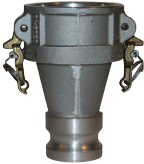
3" coupler x 2" adapter