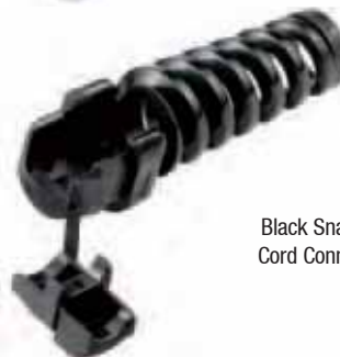
Black Snap-In Cord Connector