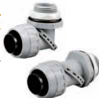
PS0509NGY – SwivelLok®

¾" Liquidtight conduit fitting have ½ N.P.T. male threads.