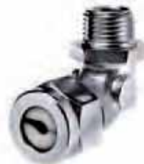
Machined Zinc-Plated SteelΔ