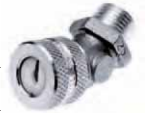
Machined Aluminum †

Δ Nuts are machined zinc-plated steel and bodies are malleable iron, cadmium plated.