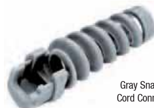
Gray Snap-In Cord Connector