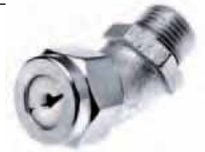
Machined Zinc-Plated Steel Δ