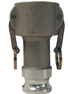
3" coupler x 2½" adapter