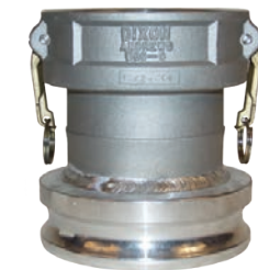
5" coupler x 6" adapter