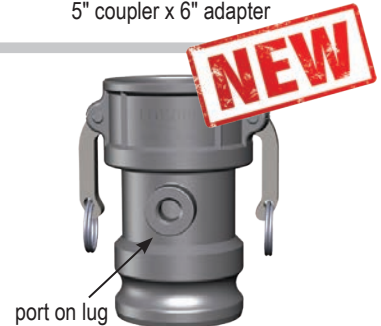
port on lug