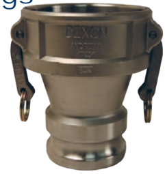
3" coupler x 1½" adapter