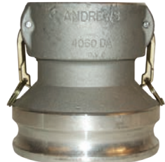
4" coupler x 6" adapter