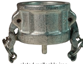
plated malleable iron