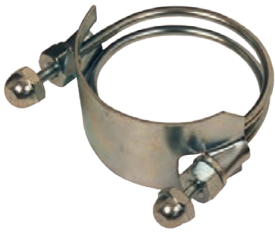
clockwise wound right hand spiral