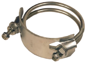
counter clockwise wound left hand spiral