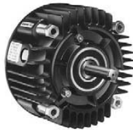
DMCBO C-Face Brake Only Module