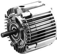
DMCCB C-Face Clutch/Brake Module

All parts should be examined for any damage during the shipping and handling process. All parts must be clean and free of any foreign material before attempting installation.