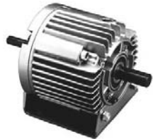
DMSCB Base Mount Clutch/Brake Module