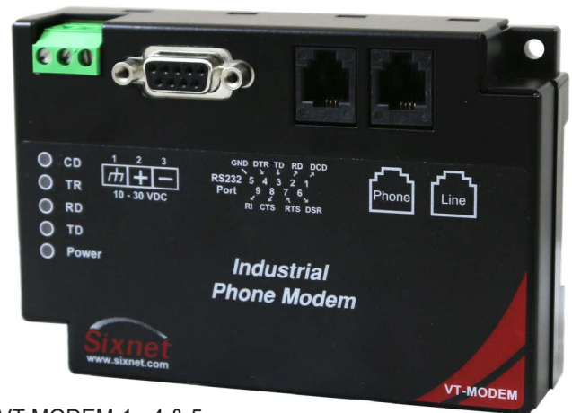
VT-MODEM-1, -4 & 5

* The VT-MODEM-4 is intended for use in pairs and may not be compatible with other brands of leased-line modems.