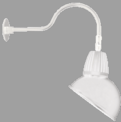
13 & 26 Watt Dome Shade LED Gooseneck Luminaire designed to match the architecture of Main Street storefronts and building perimeters. LED Gooseneck Dome Shade with 24" Goose Arm Style 1.