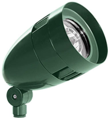
Color: Verde green Weight: 4.3 lbs