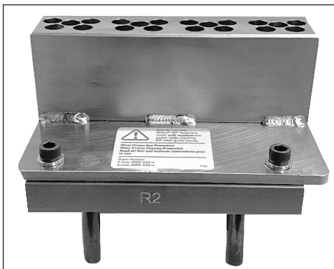
5. Final R2 locator block position.