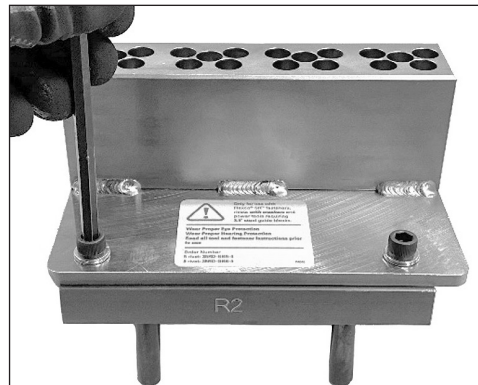
4. Reattach locator block using original socket head cap screws.