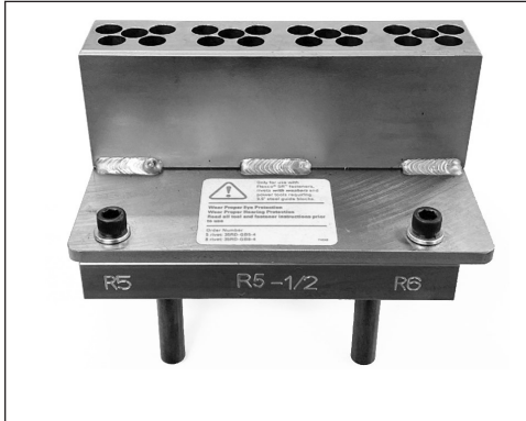
1. Original R5, R5-1/2, R6 locator block position.