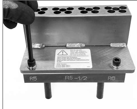
2. Remove two socket head cap screws using 1/4" Allen wrench.