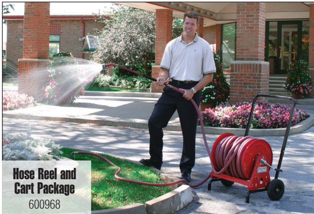
Hose Reel and Cart Package 600968