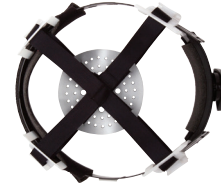
HP141 – Cap Style 4-point Ratchet Replacement Suspension