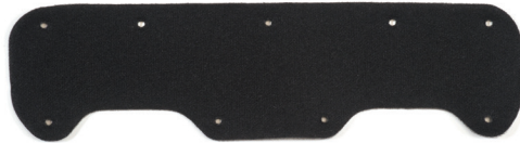
BPRBAND – Bump Cap Sweat Band

Shell constructed from polyethylene materials