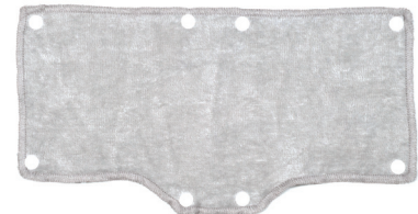
HPTRBAN – Hard Hat Terry Cloth Sweat Band