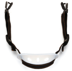
HPCSTRAP – Chin Strap