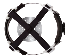
HP241 – Full Brim 4-point Ratchet Replacement Suspension