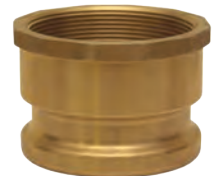
with NPT thread