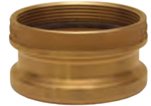
with NPSM thread