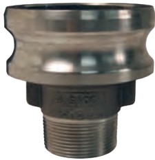
reducing male adapter x male NPT