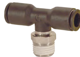
tube to male BSPT