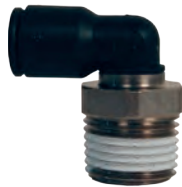
tube to male BSPT