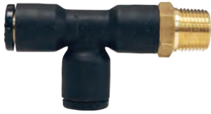
tube to tube to male NPT