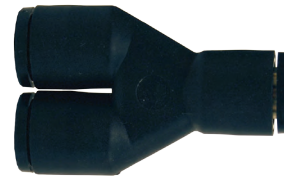
tube to tube to tube