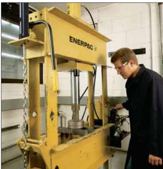
◀ An Enerpac H-Frame press quickly removes the shaft from this assembly.