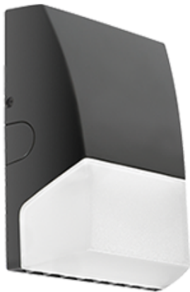
The versatile, low-cost, low-profile wall pack. BRISK™ - efficient and affordable LED light. Color: Bronze Weight: 4.2 lbs