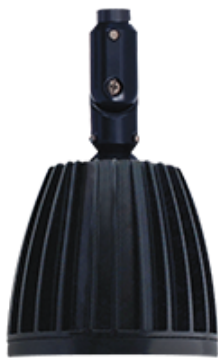
LED Gooseneck Head available in 13W or 26W. Color: Black Weight: 5.0 lbs