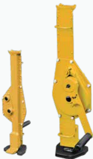
LPC30 & LPC100 Shown

Capacity Range .....► 1.65 - 11.13 tons Stroke Range .....► 11.81 - 13.78 in. Minimum Height .....► 28.50 in.