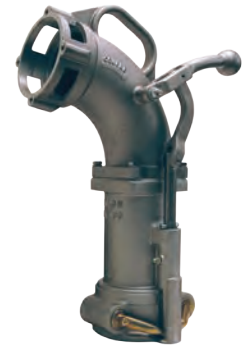
drop elbow with side lever without inlet connection