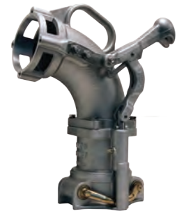
self-locking drop elbow - no inlet