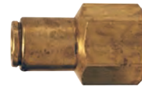
tube to female NPTF