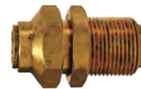
tube to male thread