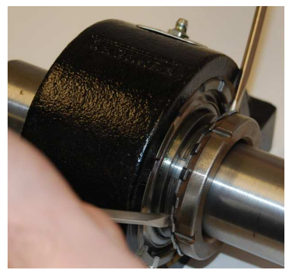
Figure 2) Zero Shaft Fit – Pry against housing to draw adapter sleeve through bearing. Sleeve should not be protruding out the backside of the inner ring.