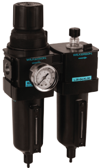
with metal bowl