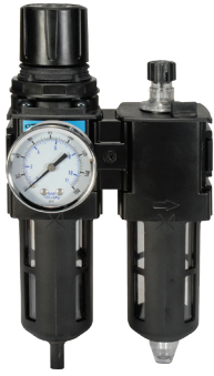
with transparent bowl and guard