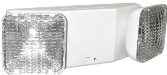
Product Shown EL2N-W