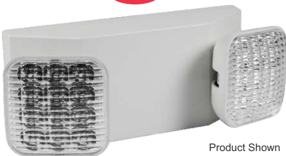
Product Shown EL2NM-LED-W