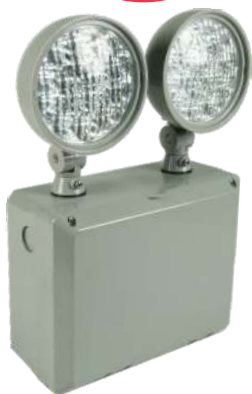
Product Shown EL2TN4-LED-GY