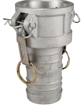
A380 permanent mold aluminum

· see page C-40 for Global Crimp Type C couplers