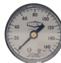
Standard center back mount gauge