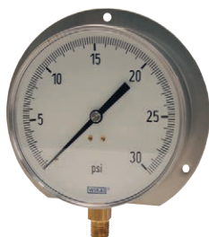
Contractor Pressure gauge