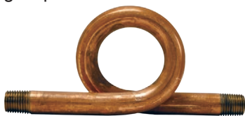
180° steam gauge siphon