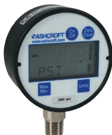
General Purpose digital gauge