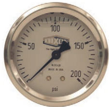
Stainless Steel center back mount gauge