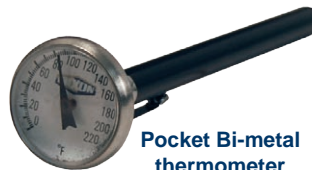
Pocket Bi-metal thermometer