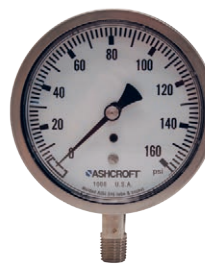
Stainless Steel Standard gauge