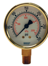
Brass Standard gauge