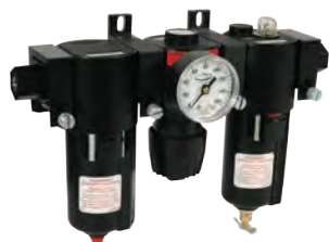
with metal bowl