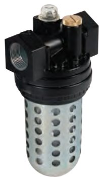
transparent bowl with guard