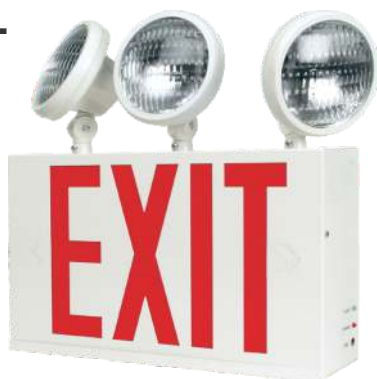
Product Shown NYEECL-W