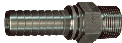
For Use With Clamps*